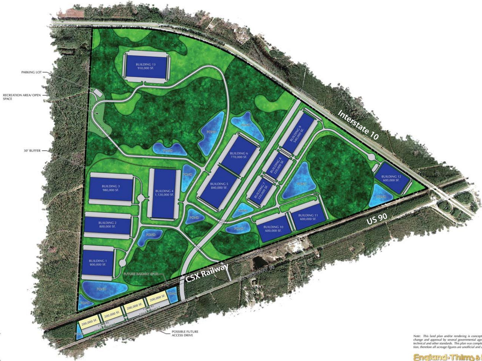
Building Summary 10,000,000 sf. Total Site