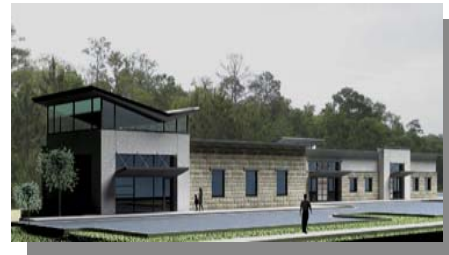
7111 Baymeadows Road Up to 6,020 SF Office Available