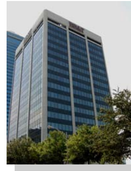
BB&T Tower Up to 31,183 SF Office Contiguous Available