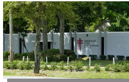
5526 Arlington Road 8,300 SF Freestanding Bldg. Available for Sale

HEATHER PREDILETTO OFFICE SPECIALIST, OFFICE SERVICES GROUP