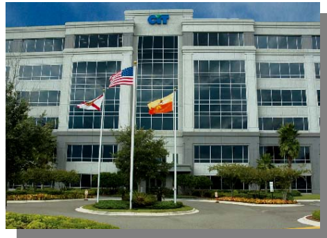
10201 Centurion Pkwy North Up to 40,000 SF Available

If you are already working with a Broker, be sure to ask them about the following buildings: