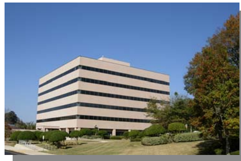
7960 & 8000 Arlington Exway Up TO 80,000 SF Office Available